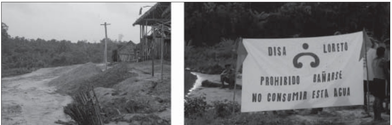
Figure 2: An outbreak of leptospirosis occurred in a swimming hole (left) at the edge of a newly developed village, Los Delfines, 10 km outside the city of Iquitos in the Peruvian Amazon. This outbreak resulted in the death of three children who had renal and respiratory failure, and cutaneous and gingival haemorrhage. Sixty-seven people sought medical attention for undiagnosed fever. Quantitative analysis of the creek running from the pig farm to the swimming hole showed that a new pig farm upstream of the village was the source of the outbreak. The Directorate of Public Health (DISA Loreto) placed a warning sign (right) at the swimming hole translated as 'swimming prohibited. Do not drink this water'