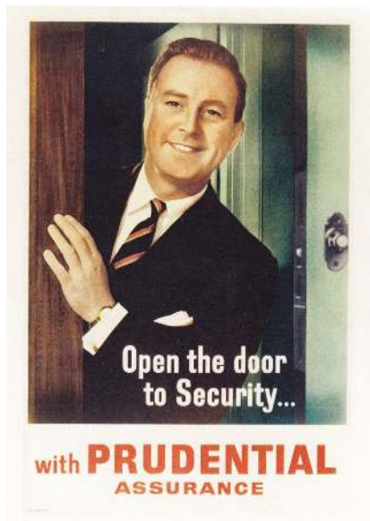
Figure 3 1936 Prudential Advertisement (PRU)

By the 1930s the agent, at the doorstep, at the garden fence or at the fireside was becoming an increasingly common theme in advertising and promotional materials. While ‘injecting a little fear’ was already a well-established advertising strategy and while insurance offers huge scope for playing on fears of death and accidents, many companies often preferred instead to feature agent’s visits and reassuring, everyday, scenes. This tendency was taken further when the Prudential opted to turn the mildly pejorative phrase ‘the man from the Pru’ to its advantage. Following a Weekly Illustrated article on the work of industrial agents the Prudential’s publicity department experimented with adopting the phrase as a slogan. The studied average ‘Man from the Prudential’ went on to become an iconic visual brand for more than twenty years. The first ‘man’ was drawn from a real life agent, Fred Sawyer. Sawyer was a bit too heavy and scruffy to last as the model of the good, average, (as critiqued by the then Chancellor, Stafford Cripps) and was soon redrawn from another model, Mr Bradley, who was further anonymised to better represent a typical agent in 1965.