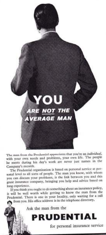
Figure 5 Men from the Prudential, Prudential Bulletin 1965

As a visual brand the 'man' graced a wide range of advertising and marketing materials, sometimes centrally and sometimes as a corner logo. The 'man from the Prudential' was an ideal average, anonymous, respectable and safe even while reassuring customers that they, of course, were not average or anonymous to the company (See Figure 5).