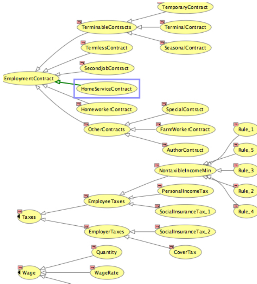
Figure 4. Payroll system ontology