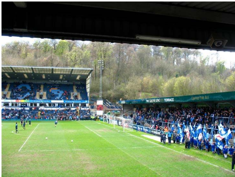
Figure 4. Fan photograph– ‘A combination of the traditional and modern’

Purpose built stadium on the edge of town, corporate boxes, that is now called the Green King Terrace, so corporate sponsorship of the stadium, a dying image of football today is a standing terrace behind the goal, integration with local schools, getting kids involved, that's a positive sign of football today. Sums it up quite well. That's the modern and the old fashioned together. (League 2 club fan, male, aged 47)