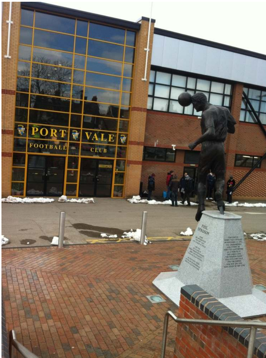
Figure 5. Fan photograph – ‘Club statue 1’

Some participants used ‘the state of football’ to present images that demonstrate how football should be. Images in this category highlight aspects such as community, loyalty, pride, spirit, inclusion, and tradition. Two participants captured this by including images of statues outside the grounds of their respective teams, explaining the relevance of these and how they reflect aspects of football that have been lost (Figures 5 and 6).