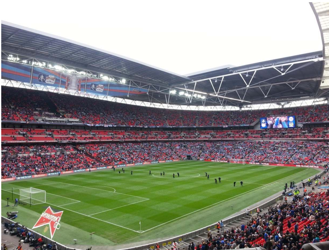
Figure 3. Fan photograph – ‘The corporate ring at Wembley’

This passage again references a perceived decline in atmosphere in football grounds. It suggests the impact this is having on the fan of the appeal of elite professional football.