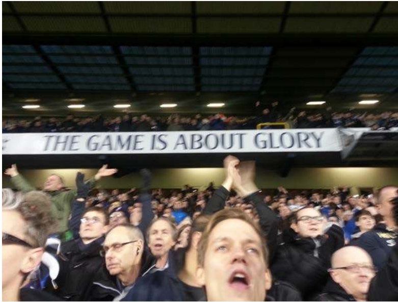
Figure 7. Fan photograph – ‘The game is about glory’

The construction we have found of this ‘fan experience’ presents a mixture of purely service quality aspects, even if not framed directly this way, with other social, historical and less tangible dimensions. Improved facilities would make attending football a better ‘experience’, with atmosphere and build-up to the game is a key contributor to this. The importance of fan experience is taken to its highest relevance by a participant arguing that sometimes football is not just about winning and getting a result, but about something else that needs to be preserved: