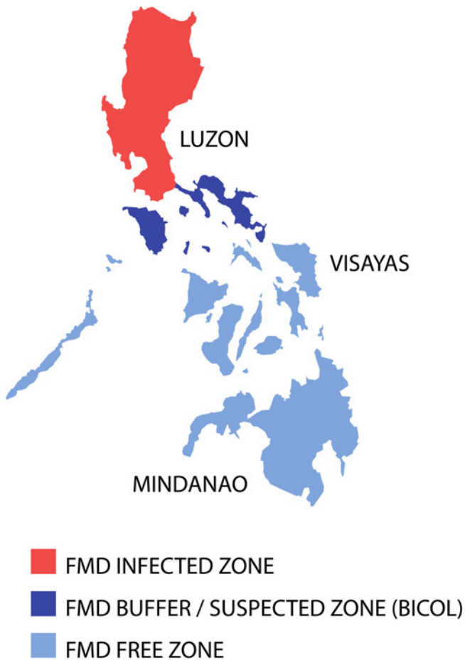
Fig. 3. Map of the Philippines displaying the zoning for FMD eradication in 1998. Adapted from Windsor et al. [63].

of Animal Industry submitted documentation to support a status of 'FMD-free without vaccination' in northern and southern Luzon, and FMD-free with vaccination in central Luzon [63, 64]. Achieving these statuses would classify the Philippines as an 'FMD-free country where vaccination is practiced' under the guidelines provided by Article 8.5.3 of the 2009 OIE Terrestrial Animal Health Code [65]. Following the absence of FMD outbreaks for more than 3 years, a complete withdrawal of FMD vaccination was implemented, and the Philippines obtained the OIE recognition as FMD-free country without vaccination in June 2011 [64].