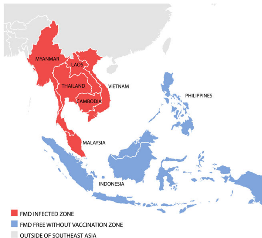
Fig. 1. Map of SEA indicating FMD disease status.

these lineages arose from a common ancestor approximately 35 years ago [4]. Viruses belonging to the O/SEA/Mya-98 lineage have been detected in all six countries of continental SEA over the past 15 years, while the O/SEA/Cam-94 lineage was only identified between 1989 and 2003 and may be considered extinct [4].