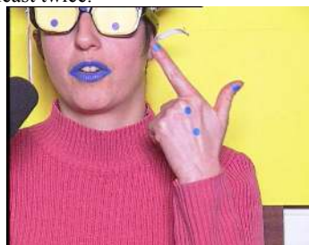
Figure 2: Image of the speaker.

The data was obtained from a video recording of a speaker pronouncing and coding in French CS a set of 267 sentences, repeated at least twice.