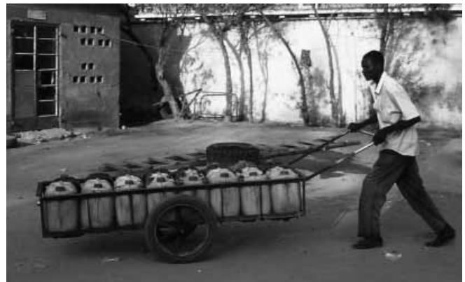
Figure 3 | Water vendor in a street of Kano City, March 1996.

This cholera outbreak caused substantial death, disease, and economic loss. In addition, it created major concern as it occurred at a time when pilgrims were heading to Mecca. However, a rapid epidemiological investigation was possible and yielded useful results that suggested that drinking water sold by water vendors and failure to wash hands with soap before meals were independently associated with illness. In addition, as an ongoing rumour attributed the outbreak to the municipal water supply system, the epidemiological information that ruled out this hypothesis was most useful to local public health officials. Given the complex situation in Kano State, a large-scale intervention to increase access to safe water and improve hand hygiene practices was not undertaken. However, health officials communicated the results of the investigation to the public through a radio address which may have affected people's practices. Although no epidemiological