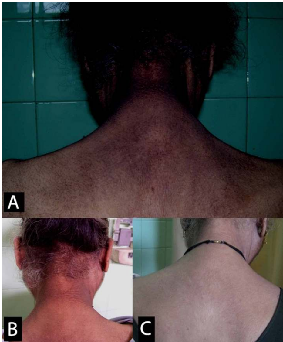
FIGURE 3: Resolution of acanthosis nigricans

A: before treatment; B: at two weeks post-discharge; C: at the two-year follow-up