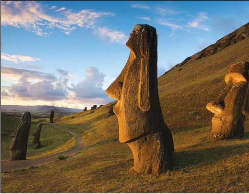
FIGURE 2 – Easter Island. Nowadays mostly barren after the complete deforestation of the 15th and 16th centuries, this led to a complete collapse of the Rapa Nui civilization.