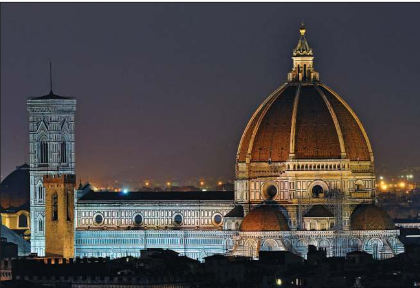
FIGURE 3 – The shortage of wood induced Filippo Brunelleschi to invent revolutionary techniques to build the magnificent and still unmatched masonry dome of the Florence Cathedral in 1420.

the extraordinary dome of Santa Maria del Fiore in Florence (Figure 3), the largest ever built in masonry (43 m in diameter and 60 m high), he would use a colossal quantity of timber to build the dome with the traditional scaffolds and forms, producing prohibitive costs even for the standards of the wealthy city [16]. He solved the problem by designing