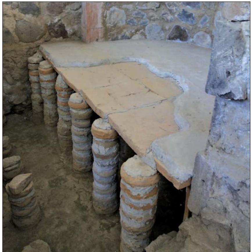
FIGURE 1 – The hypocaust of a Roman villa from the third century AD. The subfloor for hot-air heating is clearly visible (neighborhood of Yerveran, Armenia).