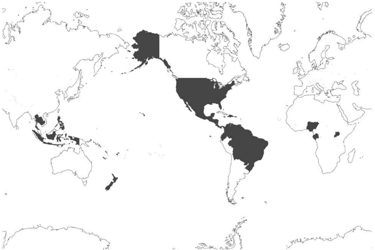
Figure 2. All countries and regions reporting laboratory-confirmed autochthonous Zika virus cases, January 1, 2015–February 10, 2016 (online Technical Appendix Table 2, http://wwwnc.cdc.gov/EID/article/22/7/15-1990-Techapp1.pdf ). Data represent outbreaks and case reports for all reported autochthonous laboratory-confirmed cases of Zika virus infection, including those reported in the peer-reviewed literature; public health agency Web sites, bulletins, and broadcasts; and media reports for selected dates.

Ae. aegypti mosquitoes, which laboratory experiments have shown to be capable of transmitting Zika virus (26,27). Ae. hensilli mosquitoes were implicated in the Yap outbreak, yet Zika virus has never been isolated from these mosquitoes (28,29). In Africa, the predominant Aedes species vector has not been definitively identified, although viral isolation studies suggest that Ae. albopictus was the likely vector in a 2007 Zika virus outbreak in Gabon (23).