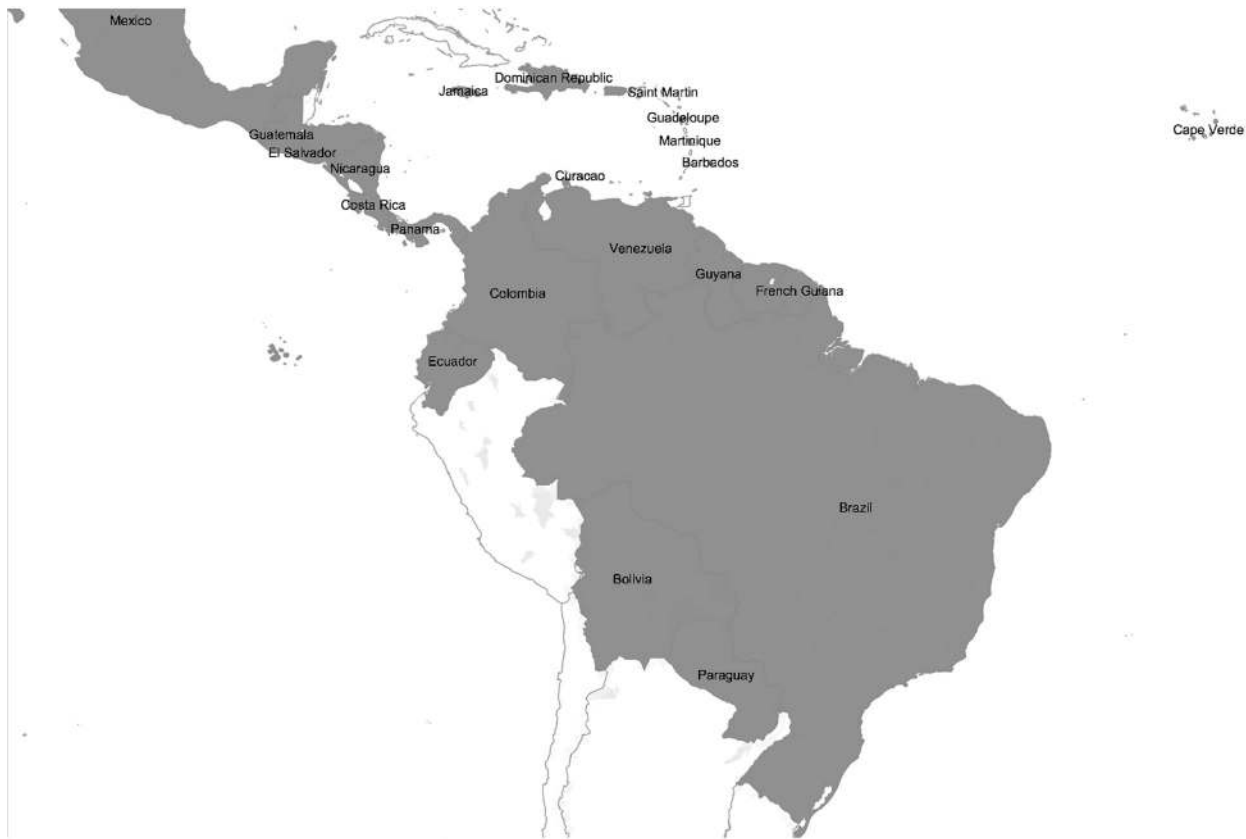
Figure 3. South America, Central America, and Caribbean countries and regions reporting laboratory-confirmed autochthonous Zika virus disease cases during January 1, 2015–February 10, 2016 (online Technical Appendix Table 2, http://wwwnc.cdc.gov/EID/article/22/7/15-1990-Techapp1.pdf ). Data represent outbreaks and case reports for all reported autochthonous laboratory-confirmed cases of Zika virus infection in these countries and regions during January 1, 1952–February 10, 2016, including those reported in peer-reviewed literature; public health agency Web sites, bulletins, and broadcasts; and media reports.

exposure to mosquitoes (40); no definitive mechanism for transmission was described for either patient.