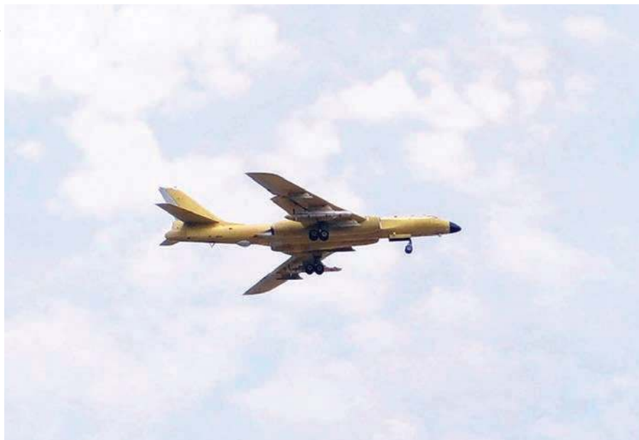
H-6K bomber carrying CJ-10 LACMs