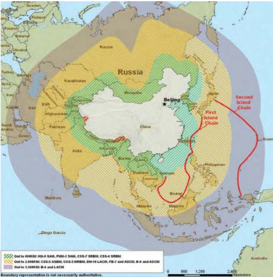
Figure 3.1. China’s Conventional Antiaccess/Area-denial (A2/AD) or “Counter-intervention” Capabilities

Ground-launching requires an additional small rocket booster to get the missile off the launcher whereupon the engine is ignited until the missile flies aerodynamically. Air-launching does not require a booster rocket, but only a release mechanism to drop the missile away from the aircraft before the engine takes over. The Chinese have air-launching capabilities as evidenced by the YJ-63 LACM, which is carried by the