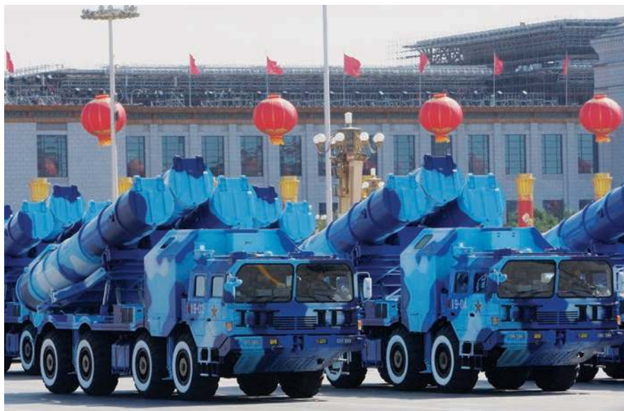
DH-10 LACM transporter erector launchers in 2009 Beijing parade