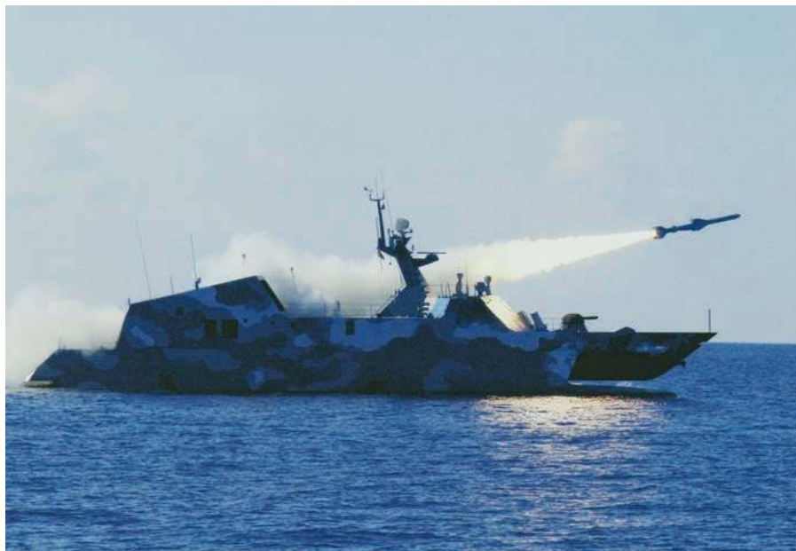
Type-022 Houbei -class catamaran firing one of its eight YJ-83 ASCMs