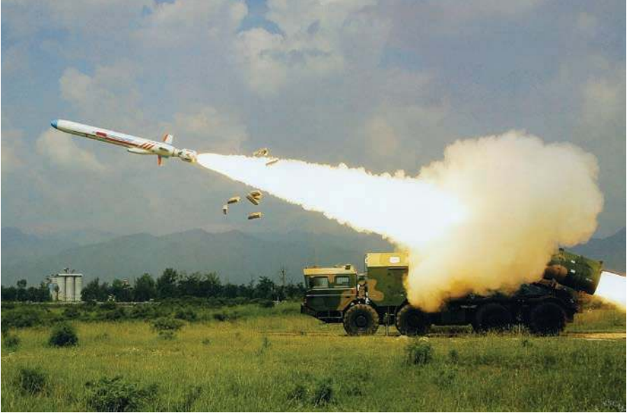
YJ-62 ASCM being launched by transporter erector launcher