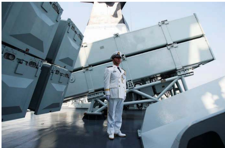
PLA Navy sailor stands on deck of a Jiangkai frigate with YJ-83 ASCM canister launchers