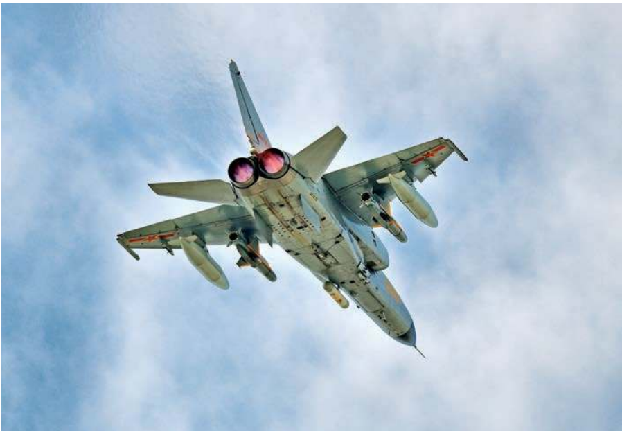
JH-7A fighter-bomber carrying KD-88 LACMs and drop tanks