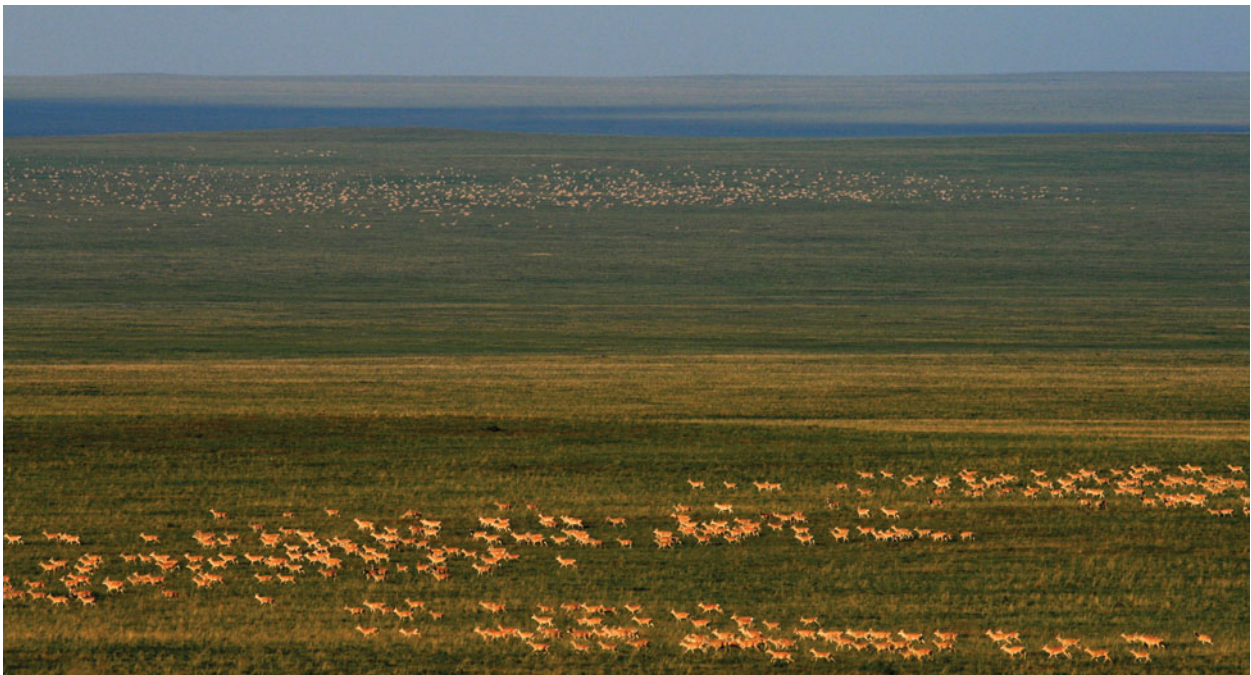
PLATE 1 Groups of Mongolian gazelles making up part of an aggregated herd of 200,000–250,000 seen in the eastern steppe of Mongolia on 12 September 2007 (Fig. 1). In the foreground, c. 325 gazelles can be seen. In the distance c. 1,100 are visible, and not visible on the far distant grasslands are thousands more.

This unusual and high concentration of gazelles is, at first consideration, a biological wonder and indicative of a species whose numbers have not yet been decimated by poaching or other causes. However, locations of good gazelle habitat vary considerably both within and among years depending on precipitation and drought conditions (Yu et al., 2004; Mueller et al., 2008). For example, during summer 2007 precipitation in some areas was well below