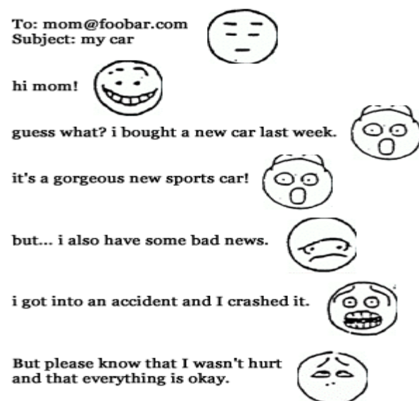
Figure 2: User Scenario

Let us walk through a scenario in which the user writes an email to her mom telling her that she bought a new car but uneventfully wrecked it. Thankfully though, she was not hurt. Figure 2 gives a walkthrough of this scenario. This is a useful scenario because it highlights some of the more advanced behavior of the affect sensing engine.