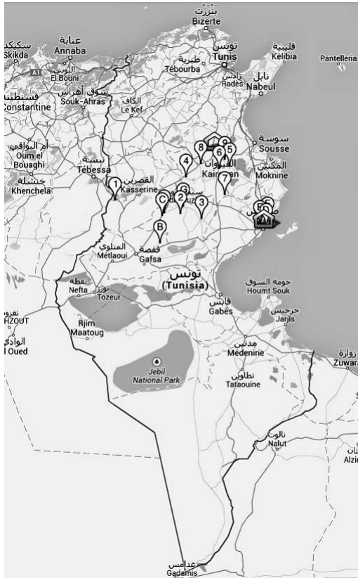
🏠: Regional offices, (1-9, A-G): Producers

consider the problem of transporting different types of live animals from farms to slaughterhouses by means of multi-compartment vehicles. They add time between consecutive tours to allow for unloading and disinfection of the vehicles. Hvattum et al. [19] deal with a tank allocation problem arising in the shipping of bulk oil and chemical products by tanker ships. They consider that a cleaning activity is required if two incompatible products are assigned to the same compartment within less than three trips.