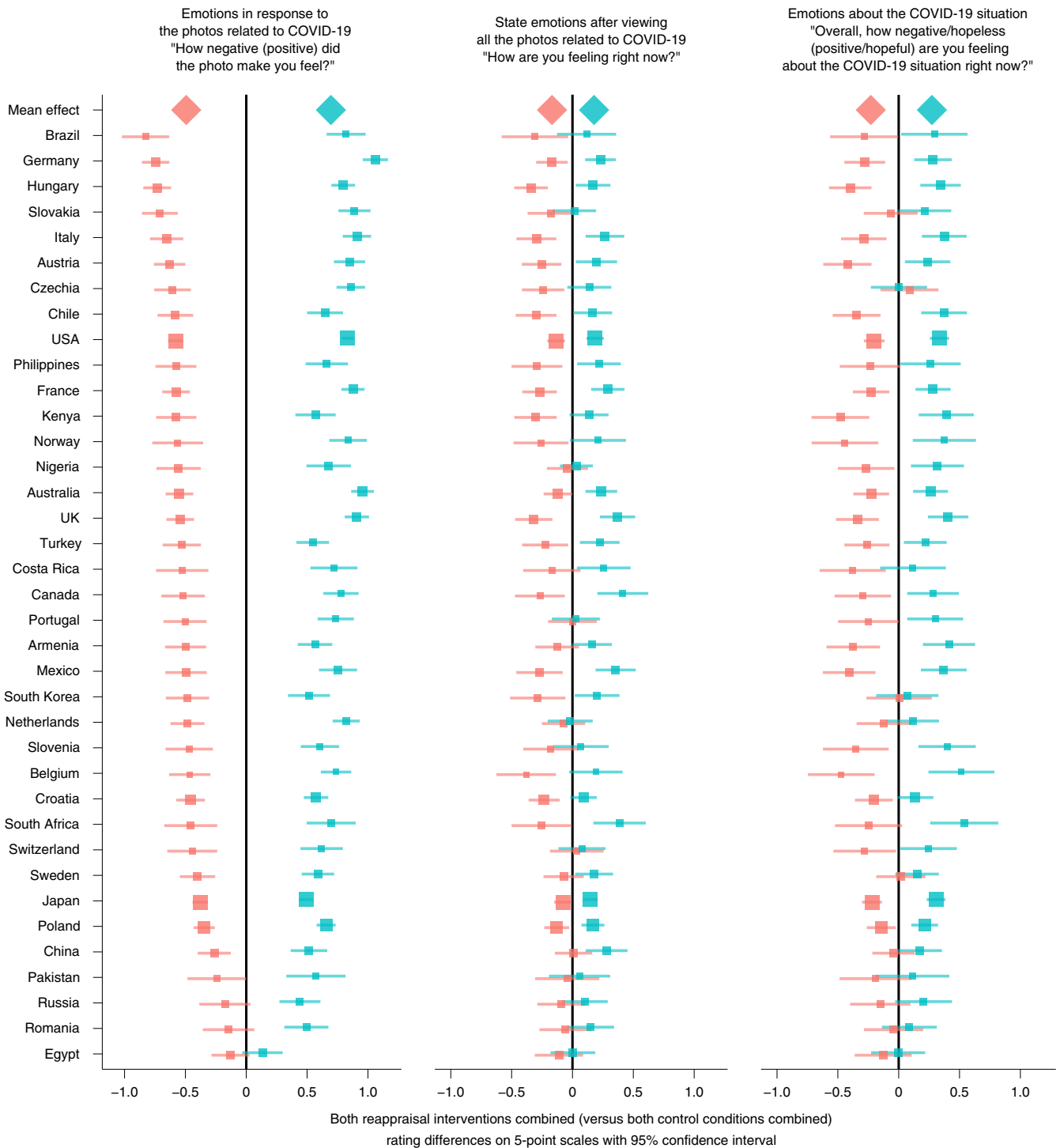
Fig. 1 | Effect sizes of both reappraisal interventions combined (versus both control conditions combined) on primary outcomes by country/region.

Valence ◆ Negative ◆ Positive Sample size ■ 200 ■ 800 ■ 2,400