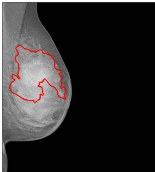
Fig. 2 Example of pixel-level annotation of an in situ cancer which is characterized by multiple calcifications