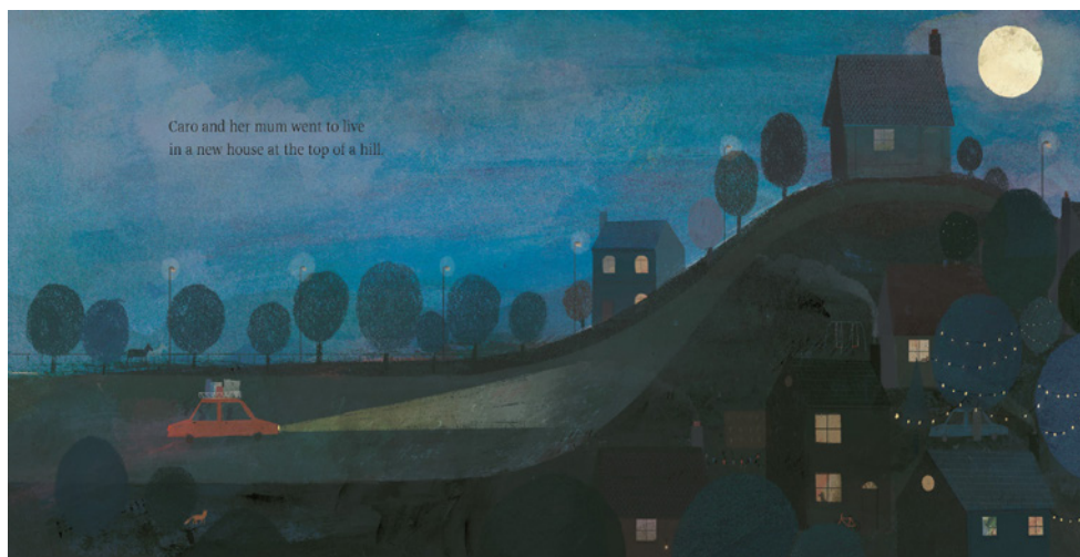
FIGURE 2. Illustrations by Richard Jones from The Snow Lion . Reprinted by permission of Simon and Schuster, UK. All rights reserved. © Richard Jones 2017

The image illustrates the words of the narrator—a change of home—and conveys Caro’s emotions. It is worth noting the visual contrast between the predominantly dark tones and the full moon that appears just to the right of the new house. Symbolically, the lights of the car point forward in that direction.