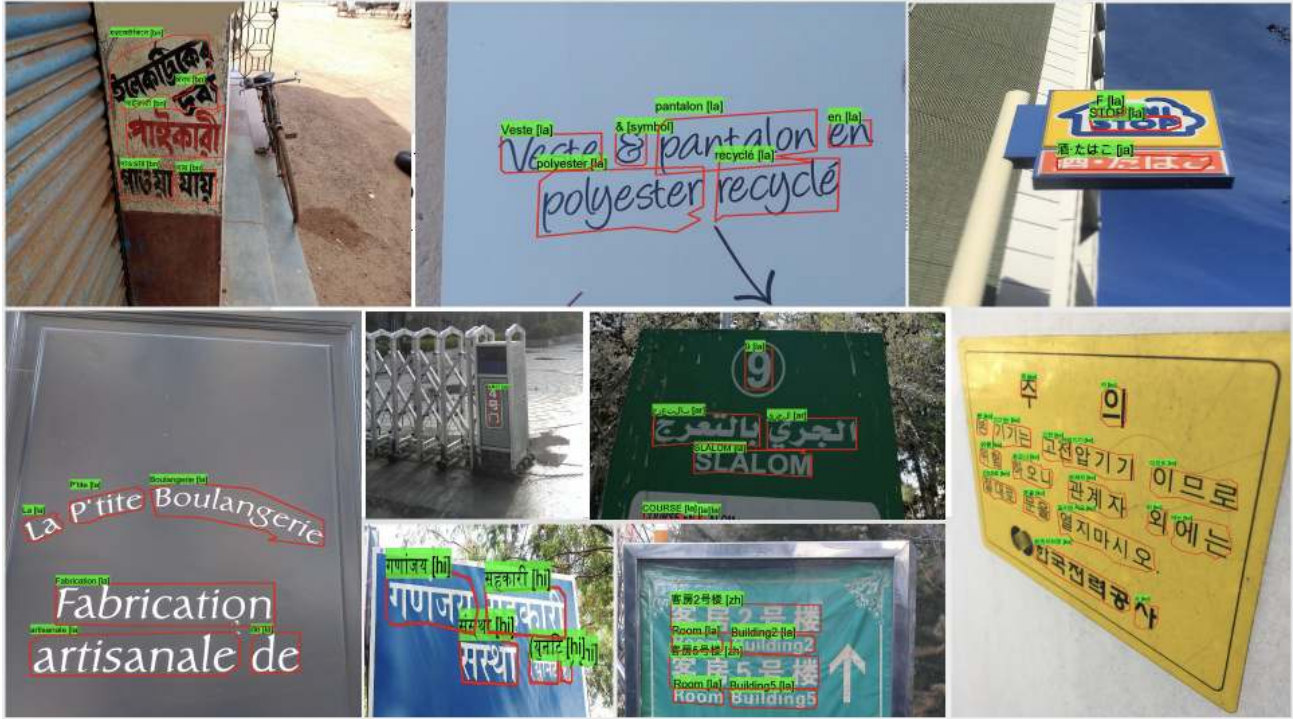
Figure 3. Qualitative results on MLT19. The polygon masks predicted by our model are shown over the detected words. The transcriptions from the selected recognition head and the predicted languages are also rendered in the same color as the mask. The language code mappings are: ar - Arabic, bn - Bengali, hi - Hindi, ja - Japanese, ko - Korean, la - Latin, zh - Chinese, symbol - Symbol.