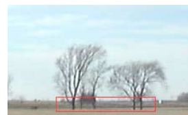
Figure 2. Scene of the lidar ground test site.

(c), (d) compose the so-called orthogonal state contrast image in polarimetric imaging. At present time, these lidar returns are not polarimetrically calibrated. Polarimetric calibration using canvas tarp is still underway.