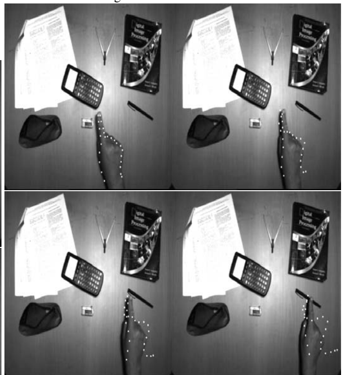
Figure 3: Hand tracking sequence – gradient based tracking refinement scheme.