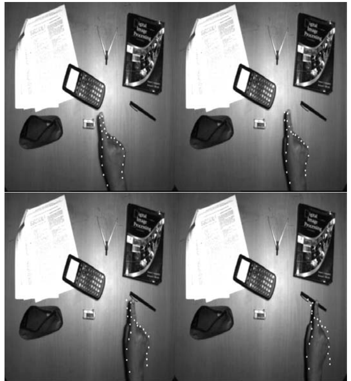
Figure 2: Hand tracking sequence – Kullback-Leibler distance based tracking refinement scheme.