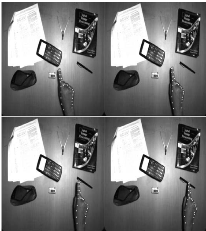
Figure 1: Hand tracking sequence – Mutual information based tracking refinement scheme