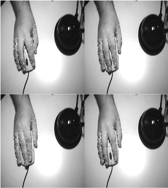
Figure 4: Finger tracking sequence obtained in the lab – Mutual information based tracking refinement scheme