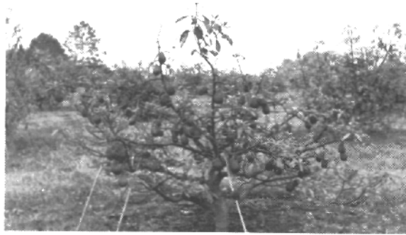
A tree of the Hass variety severely defoliated by the disease. Note that most of the fruits are sunburned.

This leaf spot disease was confined only to older leaves. On these, the first symptoms appeared as small yellowish green spots, which later extended into approximately circular, gray reddish to brown lesions 0.5-1.5 mm in diameter, slightly depressed and irregularly distributed all over the leaf surface. Elongated necrotic areas were also frequently formed by coalescence of several spots. Scattered on the lesions small black dots could be observed by the naked eye. Figure 2.