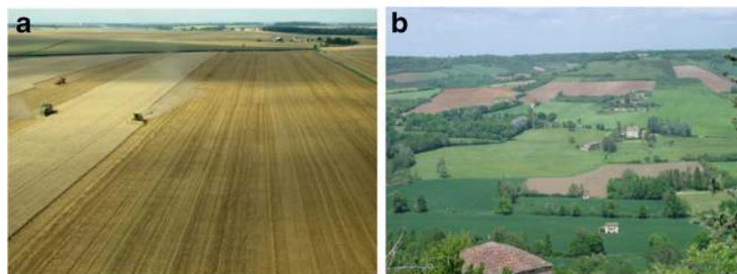
Fig. 1 Landscapes corresponding to different agriculture models (Sect. 4). a A simplified landscape shaped by input-based farming systems (Sect. 2.1) most often encompassed in globalised commodity-based food systems (Sect. 3.1). b A diversified landscape, including non-crop

habitats, in which biodiversity-based farming systems aim to develop ecosystem services from field to landscape levels (Sect. 2.3), possibly to feed alternative food systems (Sect. 3.3)