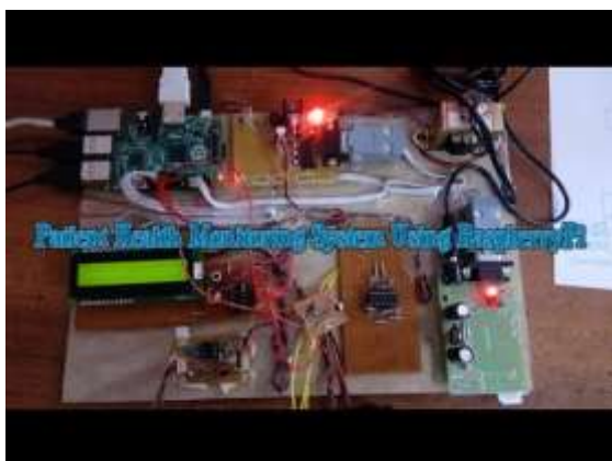
Fig. 3. Patient Health Management System using raspberry-pi

The qualities got progressively from the sensors are sent to the cloud for capacity and in addition handling. The database for every patient stores anomalous qualities for every parameter considered. On-server preparing is utilized to contrast every one of these qualities with the edges progressively. The breaks in edge values procured from the underlying phase of preparing are then sent to the Emergency Type Handler. The Emergency Type Handler then applies predefined rationale to figure out if the breaks are between related and represent a more noteworthy danger consolidated. In light of the sort of risk the Emergency Type Handler doles out the danger to one of three levels.