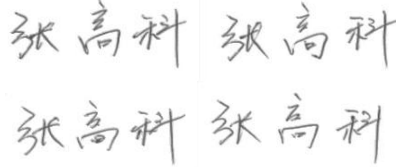
Fig 1. Signature sequence written in different time

This paper is about off-line signature verification, in this problem, signatures written in different time are not the same, but they are similar. And the similarity is the basis of signature verification. Fig. 1 is the signature sequence written in different time, and you can see the similarities of all signatures.