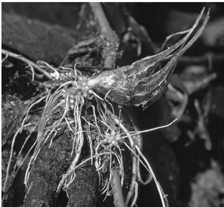
Fig. 2. Afrothismia foertheriana Th. Franke, Sainge & Agerer. Habit. Photograph by Th. Franke (Th. Franke & M. Sainge 02/030).