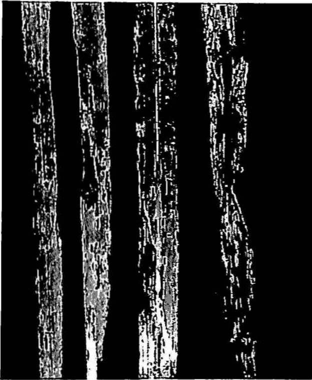
FIG. 1.—Leaf spot on sugarcane leaves caused by Helminthosporium portoricensis n. sp.

H. rostratum was described first by Drechsler in 1923 (3). Mature conidia measure 32 to 184 \mu long X 14 to 22 \mu wide with a conspicuous protruding hilum at the base. This fungus can be differentiated readily from other