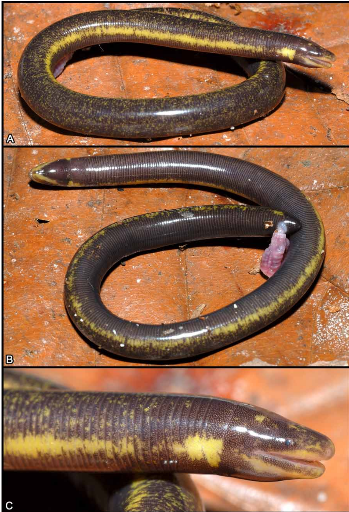
FIGURE 3. Anaesthetized holotype (IRSNB 1991) of Rhinatrema shiv sp. nov. A) Right dorsolateral view. B) Ventral view, with phallus seen in left (slightly dorso-) lateral view. C) Head and anterior of body in right lateral view.