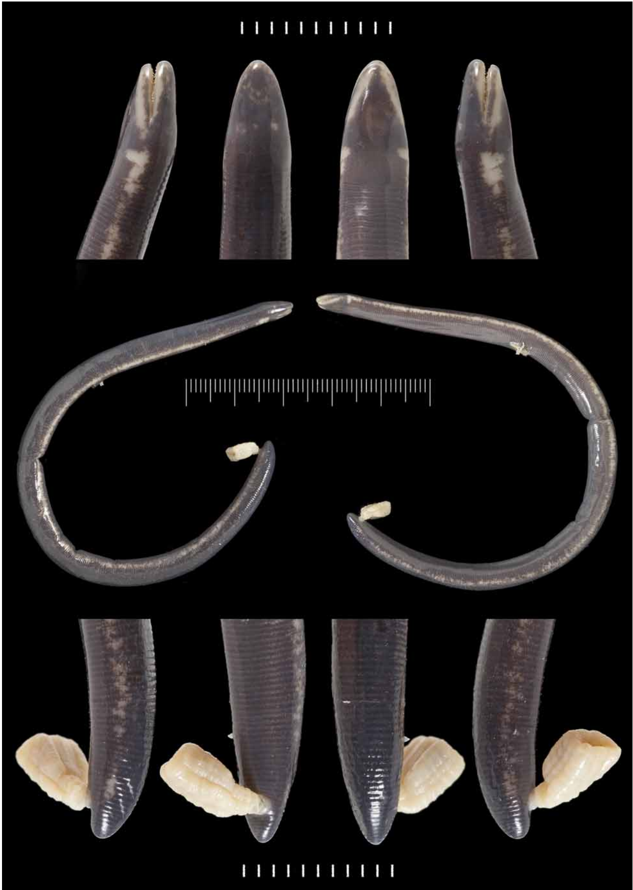
FIGURE 2. Preserved holotype (IRSNB 1991) of Rhinatrema shiv sp. nov. Scale bar gradations = 1 mm.