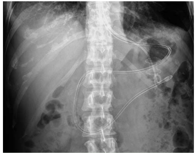
Fig. 2 Abdominal radiograph showing a 10-mm transgastric AXIOS stent in position for drainage of an area of walled-off pancreatic necrosis and a nasocystic irrigation tube (with pigtail end) that has been passed through the lumen of the AXIOS stent because of lack of clinical improvement. A nasoenteral feeding tube that was placed to ensure adequate intake is also seen.