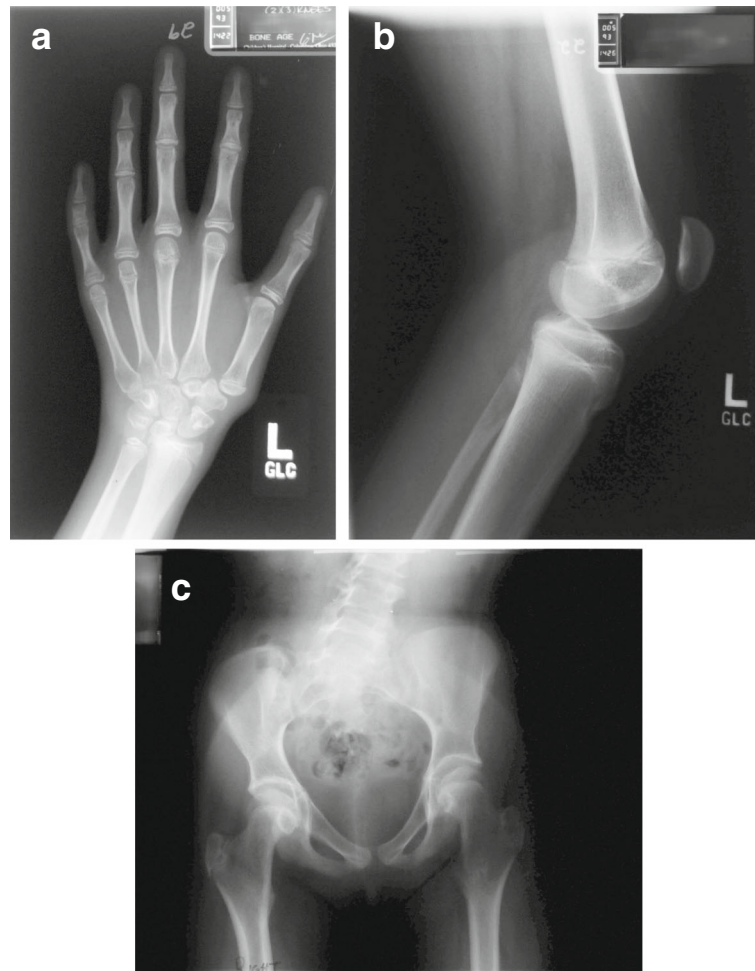
Fig. 2 a Radiograph of the left hand for bone age: The distal phalanx of each digit is small and narrow. Shortening of the middle phalanx of digits 2 and 5. Slender metacarpals 4 and 5 and short 5th metacarpal. The margins of the carpal bones are more angular than smooth. b Lateral radiograph of the Left Knee: The patellar height ratio, measured length of the patellar tendon divided by length of the patella is 1.7, normal is 1.5. Typically increased PHR is associated with increased risk of patella dislocation. c AP standing pelvis radiograph: Pelvic tilt demonstrating a leg length discrepancy. The iliac bones are narrow. Bilateral Coxa Valga is present. Acetabular coverage is good. Dysplasia of the femoral epiphysis (flat and small)

sequenced on the Illumina HiSeq 4000 (Illumina, CA). All samples were sequenced to a depth of 100X.