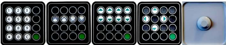
Fig. 1. The different configurations of interfaces used in our setup. From left to right (a) Number pad (b) Chevrons (c) Up-down (d) Five key (e) Dial

Since previous researchers have explored the performance effects of different layout configurations of the serial interface, we evaluate only one instance of the serial interface in our study.