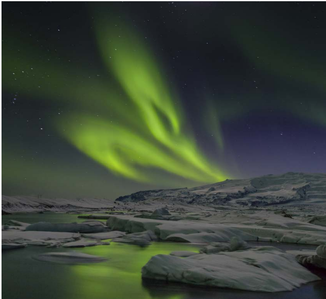
Aurora Borealis, Iceland