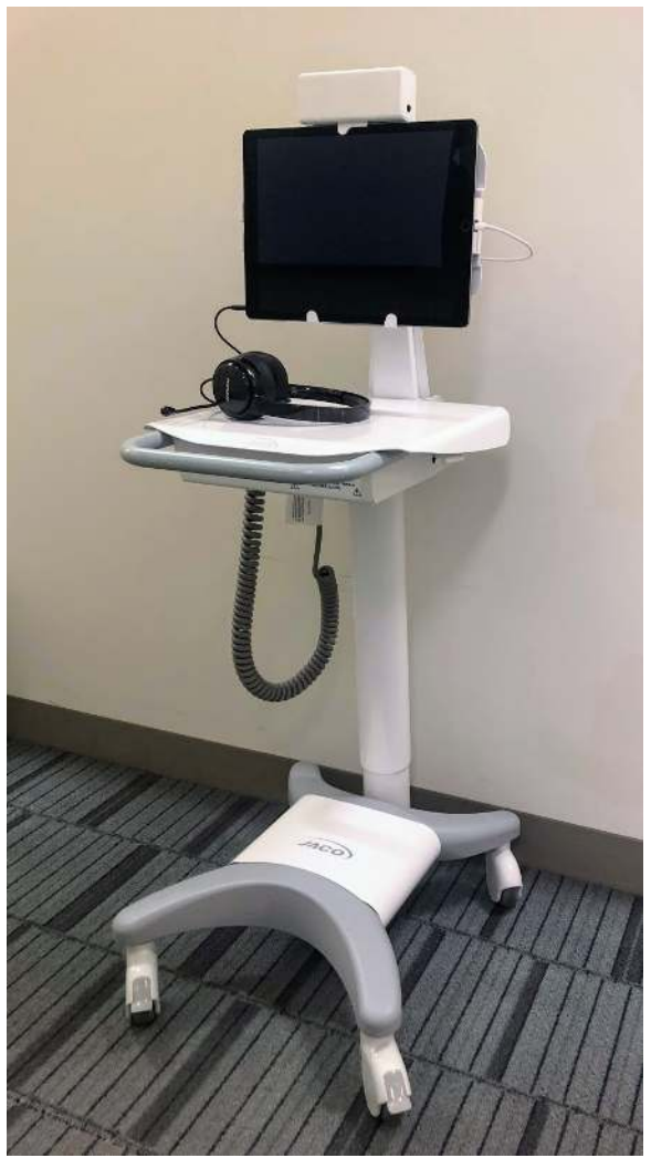
Figure 1. TeleSUDE apparatus consisting of an Apple iPad Pro tablet computer mounted on a locking JACO mobile tablet cart.