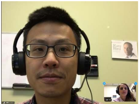
Figure 3. Screen capture demonstrating the functionality of the teleSUDE protocol during a simulated encounter between study staff.

We selected Apple tablet computers over other similar devices because of their ubiquity and uniform user interface, as well as predictable product support cycles. We felt that Apple's iOS offered a distinct advantage over other operating systems, which can suffer from version fragmentation and inconsistent user experiences due to proprietary graphic user interface overlays.