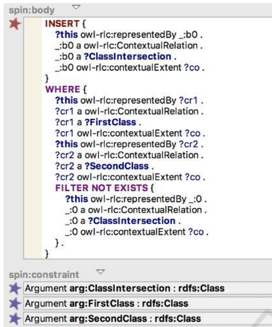
Figure 3: Template of the cls-int rule.