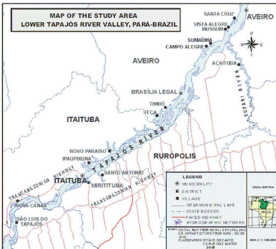
Figure 1 Map of the study area