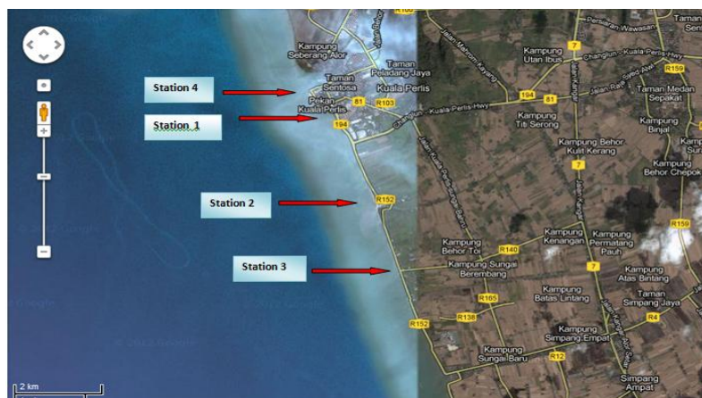
Figure 1: The sampling Location along the Coastal Area of Kuala Perlis, Perlis