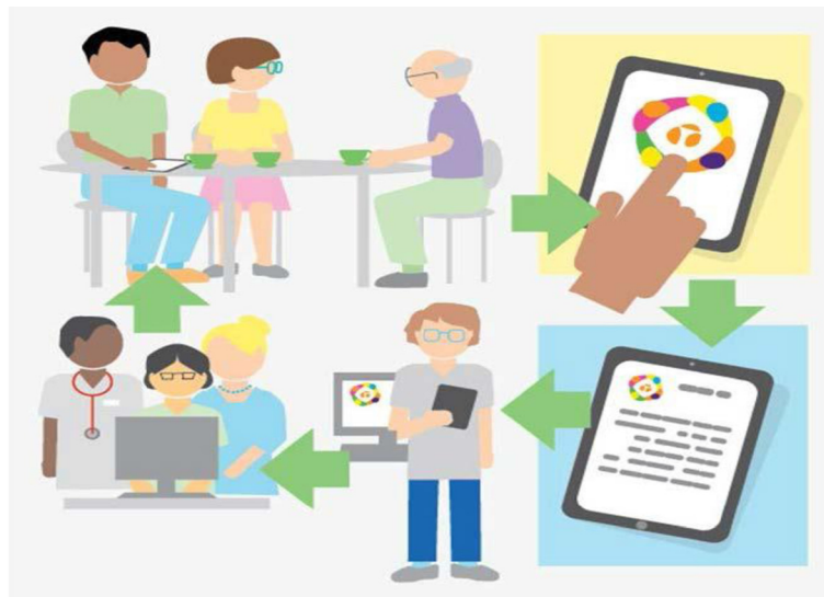
Fig. 2 Health TAPESTRY process. Volunteers visit clients in their home and use the Health TAP-App to collect information. This information is summarized on a Health TAPESTRY report and is uploaded into the person's electronic medical record to be shared with the intake team at the clinic. Reports are viewed and an action plan is developed which can include community organizations and resources, volunteer follow-up visit, and follow-up in any nature by healthcare team members and the client using their personal health record. The Health TAPESTRY process continues in an iterative fashion until the participant is discharged from the program

will take place at the end of the study. Data abstraction will occur independently in duplicate until reasonable agreement has occurred (i.e., 0.70), as calculated by Kappa statistic [50, 51]. Administrative data on health services utilization will be acquired from the EMR.