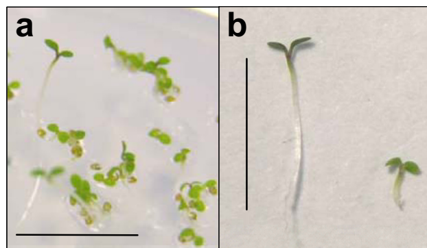
Figure 4 Rapid selection of hygromycin B-resistant Arabidopsis thaliana Col-0 seedlings. a. Seedlings from Arabidopsis thaliana Col-0 T1 seed obtained from plants subjected to floral dip transformation using Agrobacterium tumefaciens strain GV3101 harbouring the binary plasmid pBIG-HYG. Seeds were plated on 1% agar containing MS medium (including vitamins) and hygromycin B at a concentration of 15 \mu\text{g ml}^{-1} . Following a stratification period of 2 d at 4°C in the dark, seedlings were incubated for 6 h at 22°C in white light, followed by incubation at 22°C in the dark for 2 d and continuous white light for a further 24 h. b. Hygromycin B-resistant Arabidopsis seedling after rapid selection procedure (left); kanamycin-susceptible seedling after rapid selection procedure (right). Size bars 1 cm.