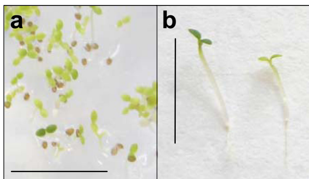
Figure 3 Rapid selection of phosphinothricin-resistant Arabidopsis thaliana Ws seedlings. a. Seedlings from Arabidopsis thaliana Ws T1 seed obtained from plants subjected to floral dip transformation using Agrobacterium tumefaciens strain GV3101 harbouring the binary plasmid pSKI015. Seeds were plated on 1% agar containing MS medium (including vitamins) and phosphinothricin at a concentration of 50 \mu\text{M} . Following a stratification period of 2 d at 4°C in the dark, seedlings were incubated for 6 h at 22°C in white light, followed by incubation at 22°C in the dark for 2 d and continuous white light for a further 24 h. b. Phosphinothricin-resistant Arabidopsis seedling after rapid selection procedure (left); phosphinothricin-susceptible seedling after rapid selection procedure (right). Size bars 1 cm.

To confirm the phenotypes of seedlings grown in the presence of hygromycin B, wild-type controls were grown alongside previously characterised hygromycin-resistant lines obtained following transformation with pBIG-HYG [8] which confers hygromycin B resistance via the hpt