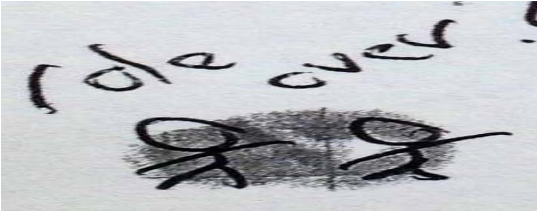
Figure 4. Rich picture illustrating 'role over'

Throughout, the student was using the journal to reflect upon her use of the software package to enable her to analyse in IPA but over time the journaling activity changed. Rather than using it to reflect on the tasks of doing the analysis, the potential for using the journal within the analysis became apparent. The student began to use the journal not just to record her thoughts about the mechanics of the data analysis process but also of the connections and interpretations she was beginning to make, including the impact of her own self on this: