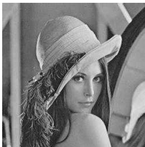
Fig. 1. lena-75-50

It is very striking that one can repeat this experiment for any photorealistic image, with the same outcome. Hence the IJG quality rating scale is not perceptually monotone.