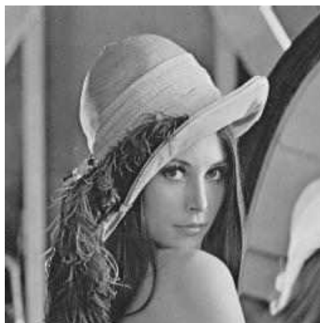
Fig. 2. lena-75-48