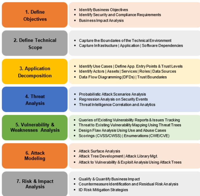
Fig. 3. PASTA Stages [4]

2) Trike : requires an analyst undertaking a threat modelling exercise to have full a grasp of the whole system while assessing the risk of attacks. This can be very challenging if the system to be threat modelled is very large. Also, the authors in [18] observed that the Trike scoring system is too vague to represent a formal. In addition, Trike does not have sufficient documentation even though its website is still available.