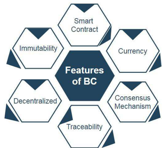
Fig. 1. Basic Features of Blockchain

Fig. 1 represents the name of basic features of blockchain.