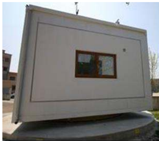
Figure 2. External view of the experimental station and window

Starting from the need for additional experimental and theoretical studies on full scale EC windows as well as to assess on-site the performances of all "smart" solution for windows, an experimental station was designed and set-up at the Department of Engineering of the University of Sannio. The station consists of a main supporting steel structure, with an external size of 6.00 m x 6.00 m and height of 5.50 m that support three removable and one not movable wall. The fixing systems of the removable walls and window were realised with the purpose of allowing their easy substitution, and then the characterization of different types of walls and windows. The cooling and heating control systems as well as the experimental data acquisition systems were installed on the not movable wall. Figure 2 shows the external view of wall where can be installed the window to test. The test facility structure was placed on a turntable with the purpose of adjusting the orientation of the experimental station.