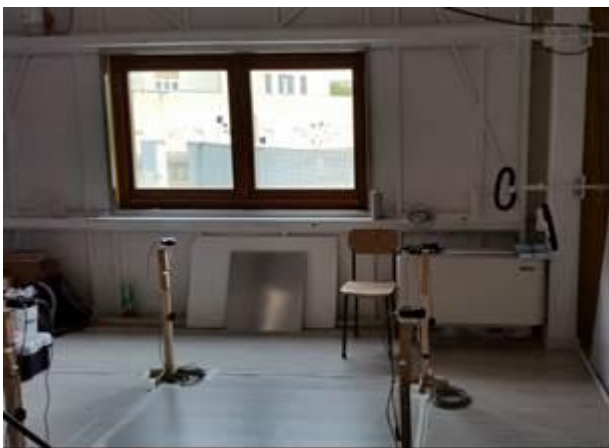
Figure 5. Internal view of the test room with positioning of the illuminance sensors