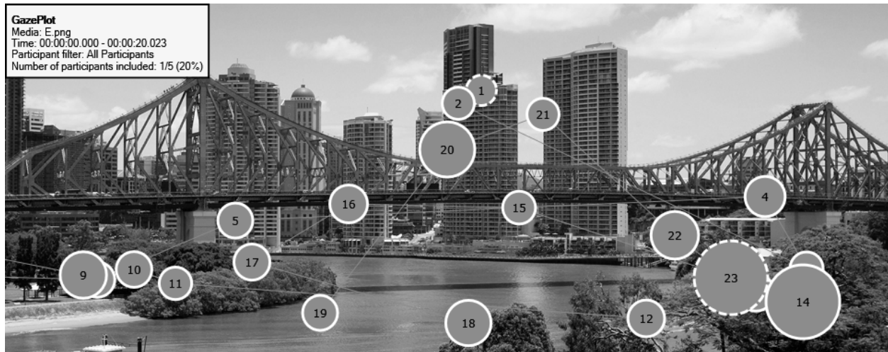
Figure 1. A scanpath-showing fixation (circles) and saccades (lines).

There are two generic types of eye-tracking data collection equipment: fixed and mobile. Fixed data collection equipment uses an infrared light source and sensors located in a fixed position such as the frame of the computer screen. More recently, lightweight mobile head or glasses mounted devices have become available which can be used when the participant is moving about a museum or street. Collecting and analysing data from mobile eye-tracking devices poses some particular problems which will be discussed below.