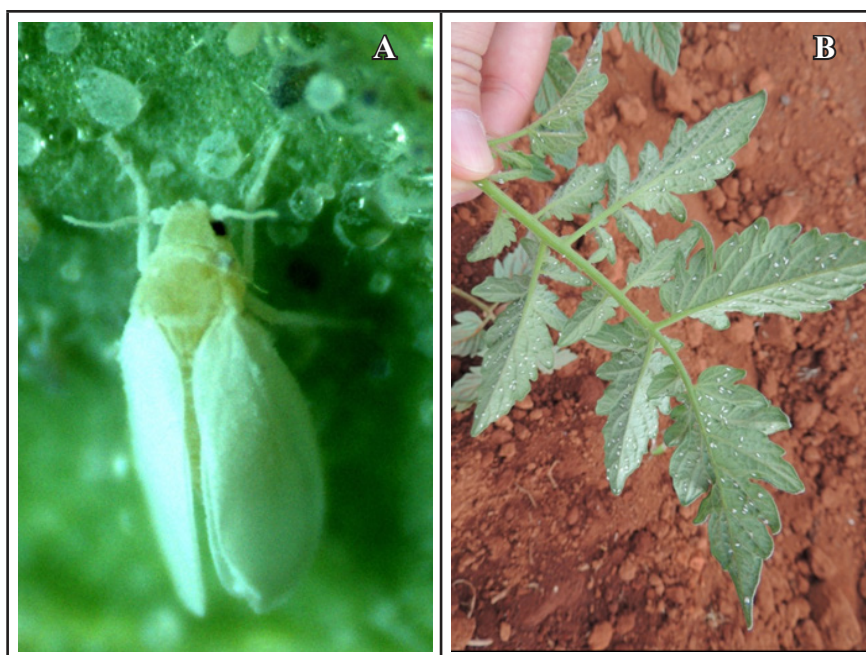
Figure 3. Adult of whitefly Bemisia tabaci (A) and a tomato leaf infested by adult whiteflies (B) {adulto da mosca branca Bemisia tabaci (A) e uma folha de tomateiro infestada por adultos da mosca branca (B)}. Brasília, Embrapa Vegetables, 2015.

chlorotic spot virus (Table 1; Coco et al. , 2013; Fernandes et al. , 2009). Symptoms of begomovirus infection in soybean include stunting, distorted growth and blistering, chlorotic spots, and light green to golden-yellow mosaic/mottling of leaves. Thus, under high begomovirus