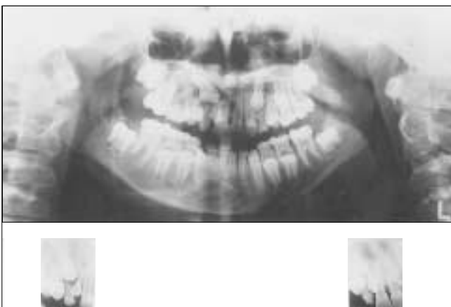
Figure 3: The degree of asymmetry of the eruption of the 13 and 23 and the overlap of the 13 with the 12 were signs of impaction. Panoramic and periapical radiographs were used to locate the 13 on the palate.

the potential for mechanical disturbances resulting in displacement and, thus, impaction.