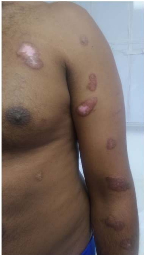
Fig. 4 Cutaneous leishmaniasis: sporotrichoid appearance of left arm

contributing to 25–70% of HIV co-infections reported in Europe [30]. Post-kala-azar dermal leishmaniasis, occurring after the initial visceral leishmaniasis syndrome, leads to cutaneous papules and nodules, commonly found on the face, or macular hypopigmentation (Table 1) [31].