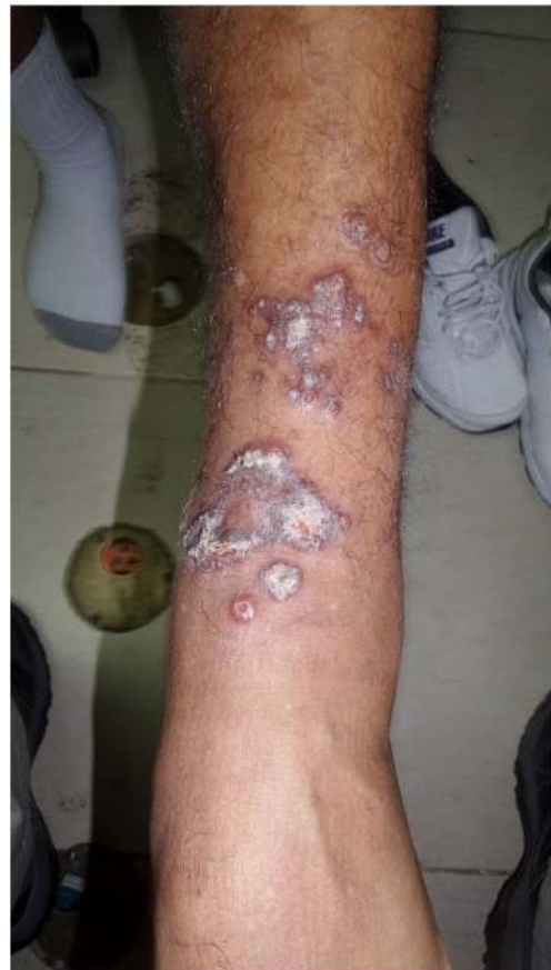
Fig. 3 Cutaneous leishmaniasis: L arm revealing diffuse CL disease