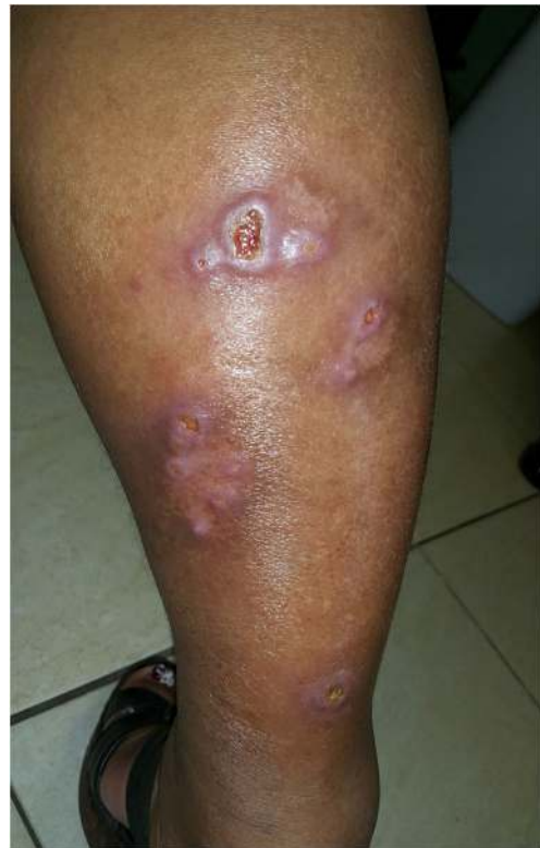
Fig. 5 Cutaneous leishmaniasis: small satellite lesions outside of the plaque/ulcer on right leg

The diagnosis of leishmaniasis is often challenging but can be made clinically with direct (parasitic) and indirect (immunologic) confirmation. Confirmation of diagnosis is often not practical in low-resource countries. The history, epidemiology, clinical symptoms, and signs on physical examination should alert the clinician of the possible diagnosis of leishmaniasis. In particular, a painless, non-purulent skin ulcer on the face or extremities in a person with recent travel to or migration from an endemic area should prompt concern for cutaneous leishmaniasis. Alternatively, prolonged fevers, fatigue, weight loss, anemia, leucopenia, and hepatosplenomegaly in a patient from an endemic region such as Africa may suggest visceral leishmaniasis (in addition to HIV, TB, and malignancy). Given