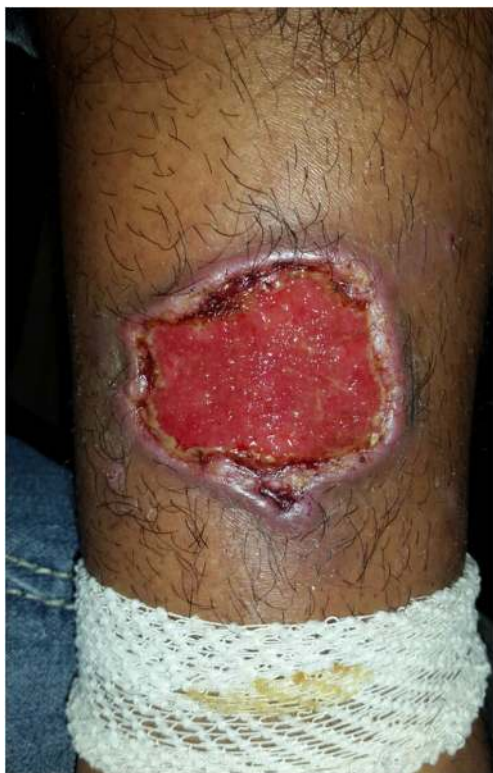
Fig. 2 Cutaneous leishmaniasis: arm ulcer with typical appearance in a patient with L. panamensis