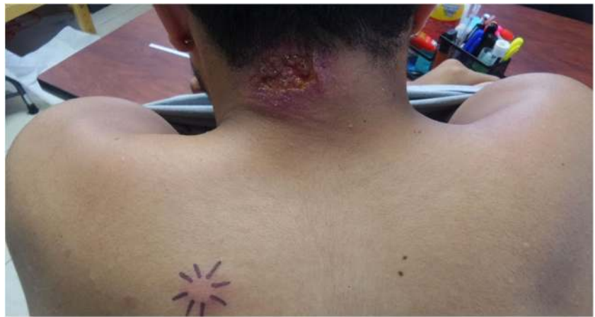
Fig. 8 Montenegro skin reaction in patient with cutaneous leishmaniasis

published reports on the efficacy of treatment based on species and geographic data (see Table 3 for more details). Collagenase ointment has been used to decrease fibrous scarring and promote the final stages of healing [51].