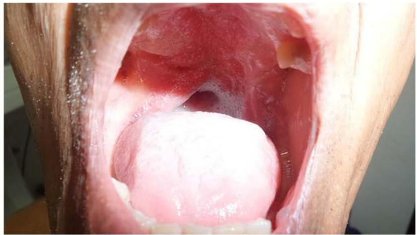
Fig. 6 Mucocutaneous leishmaniasis in a patient with L. panamensis

PKDL have large number of parasites in skin. In general, to improve the sensitivity of leishmaniasis diagnostics, various diagnostic methods should be used and multiple tissue specimens should be collected from a variety of sites especially in the setting of chronic skin lesions and mucosal disease, where fewer parasites are present [14•].