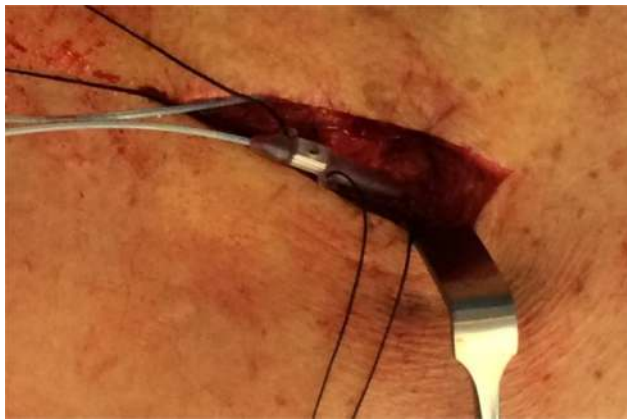
Figure 3 Intraoperative image of NX3000 anchor system by Nevro Corp.

Note: Images courtesy of Gillian Nowesenitz.