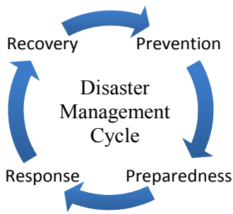
Fig. 2. Phases of disaster management cycle

Disaster management is defined as ‘the integration of all activities required to build, sustain and improve the capabilities to prepare for, respond to, recover from, or mitigate against a disaster’[12]. These four activities focus on risk management (prevention, preparedness) and crisis management (response and recovery) comprise the disaster management cycle as mentioned in Figure 2 [13]. These activities are not independent and sequential; indeed response and recovery phases initiate instantaneously, whereas populations have different long-term or short-term recovery operations can go on for days to months. Moreover, public health and economic recovery processes can take years or beyond that. The ultimate success of response and recovery activities are influenced by the data collected during the preparedness and prevention phases.