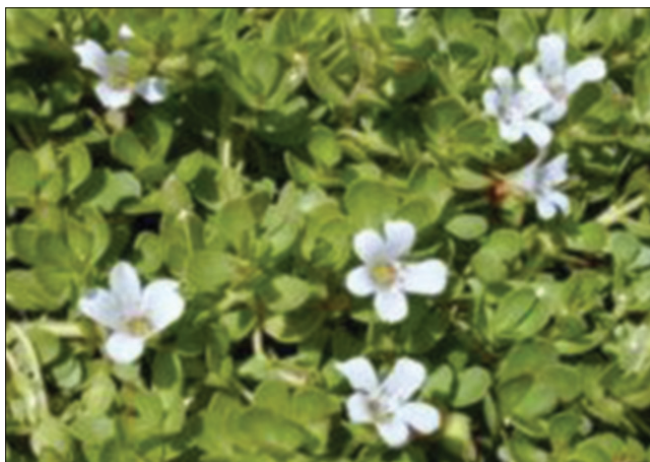
Figure 1: Bacopa monniera herb