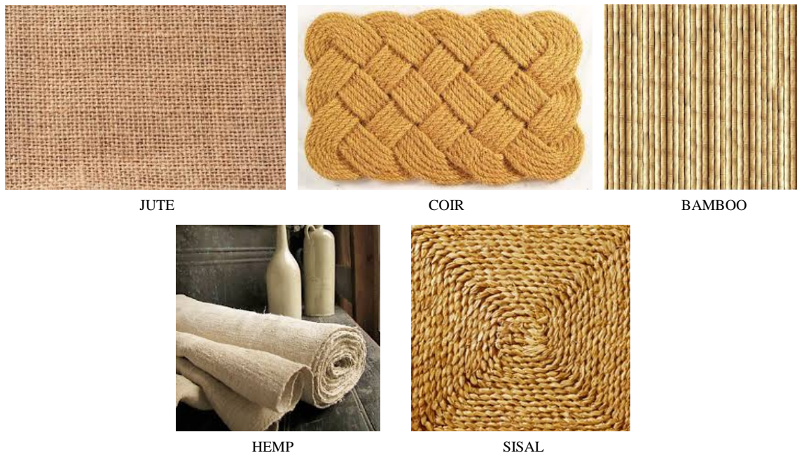
Figure 3. Varieties of Natural Fiber which are produced by plants.